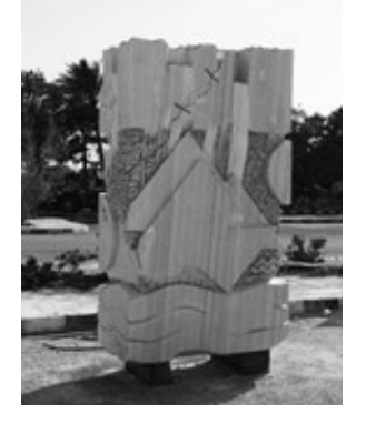
Figure 5: Civilization- v, International Monumental Sculpture Symposium, Cairo, Egypt- 2016, Marble and Metal, 300x180x80cms

His most important sculpture which has been created over the past 10 years and displayed in various countries around the world.