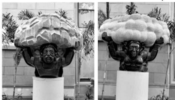
Figure 3: "Yaksha (Right) and Sakshi (left)" Ministry of Commerce and Industry Vanijy Bhawan, New Delhi, India -2018, Black Marble- 152x121x121 cms.