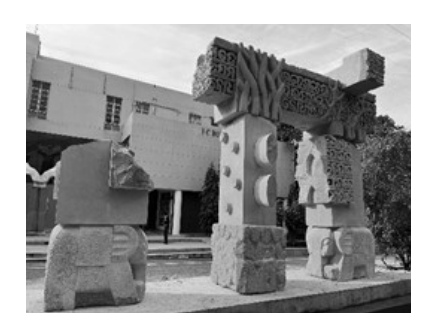
Figure 4: "Gate of Wisdom" Civilization – xxii, International Sculpture Symposiun ITM, Gwalior, INDIA- 2023, Sand Stone, 794x503x215 cms.